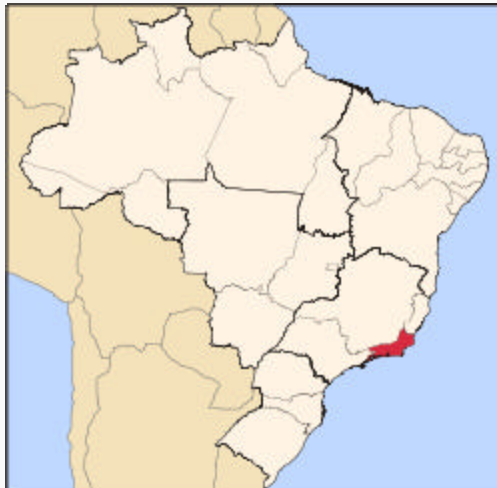
Location in the State of Rio de Janeiro

Nickname(s) : Cidade Maravilhosa ("The Marvelous City") or simply, Rio